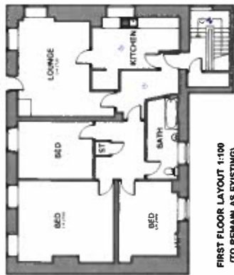
FIRST FLOOR LAYOUT 1:100 (TO REMAIN AS EXISTING)